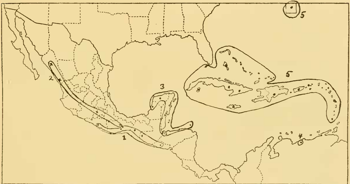
Fig. 1.—Map showing range of the species of Swietenia . 1, S. humilis ; 2, S. cirrhata ; 3, S. macrophylla ; 4, S. candollei ; 5, S. mahagoni .

and is also cultivated in botanic gardens at Trinidad, Buitenzorg, and Calcutta. Swietenia cirrhata is known in the wild condition from Sinaloa, Michoacan, Oaxaca, and El Salvador, and has been introduced into cultivation in the Botanic Garden at Victoria in Camerun. Swietenia humilis is known as a wild species from the coast of Guerrero, Oaxaca, and northwestern Guatemala. The distribution of these species, so far as it is now definitely known, is shown on the accompanying map. It remains to determine the identity of the mahoganies growing between Honduras and Colombia, and also that of the mahogany recorded from Peru as S. mahagoni in DeCandolle's monograph, at a time when only two species of the genus were known from America.